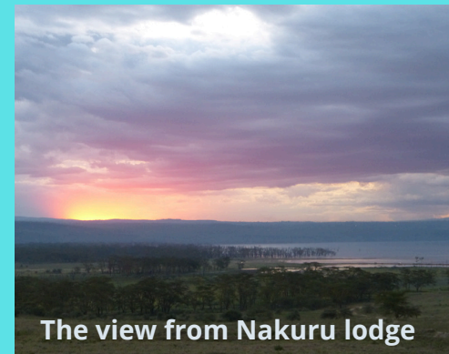
The view from Nakuru lodge