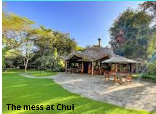
The mess at Chui