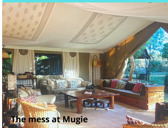
The mess at Mugie